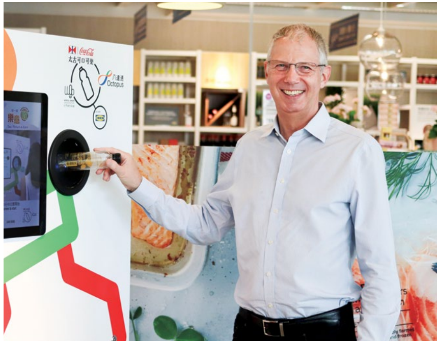
50,000 plastic bottles were saved from going to landfill via the Reverse Vending Machine trial programme.

In Taiwan, IKEA launched the very first 'circular leasing' business model in partnership with Taipei 101. Taipei 101 leases furniture from IKEA on a three-year contract, after this ends IKEA Taiwan will take back all the