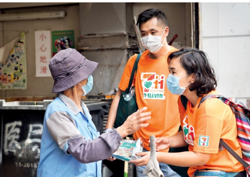
Team members distributing care packs to frontline workers who serve our communities.

In summary, as a large company, we recognise we also have a responsibility to take our corporate and social responsibility seriously. Through our People, Products, Planet and Partnerships approach, we want to make a positive difference.