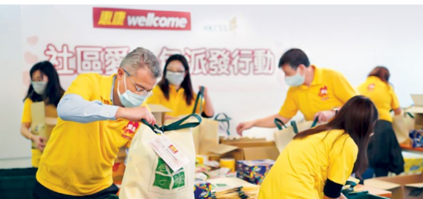
Preparing care packs for local communities.