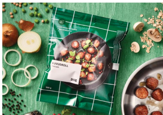
Meat-free IKEA 'Plant Balls' – a more sustainable choice.